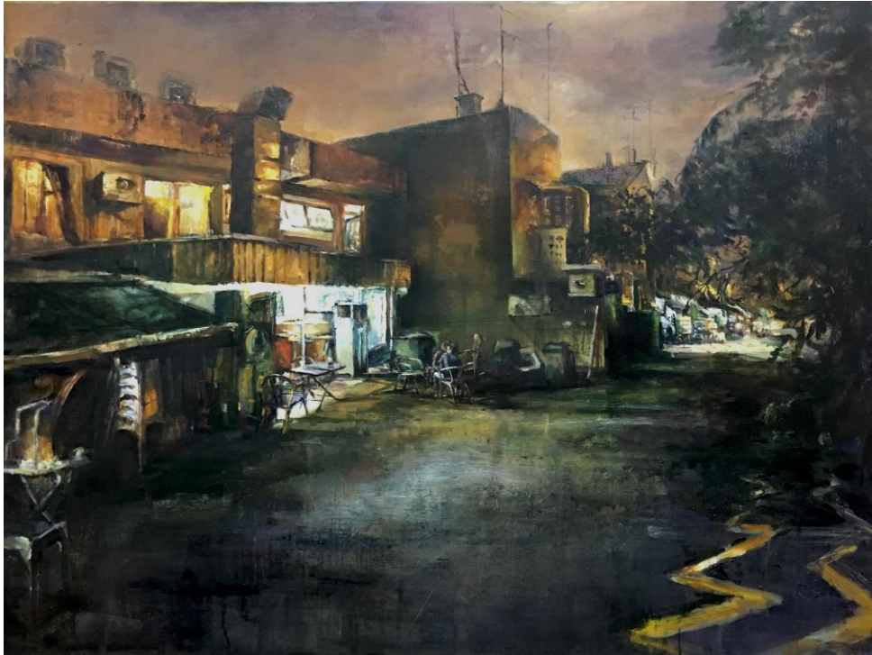
Deep into Life #11, oil on canvas, 85x110cm, HK$13000