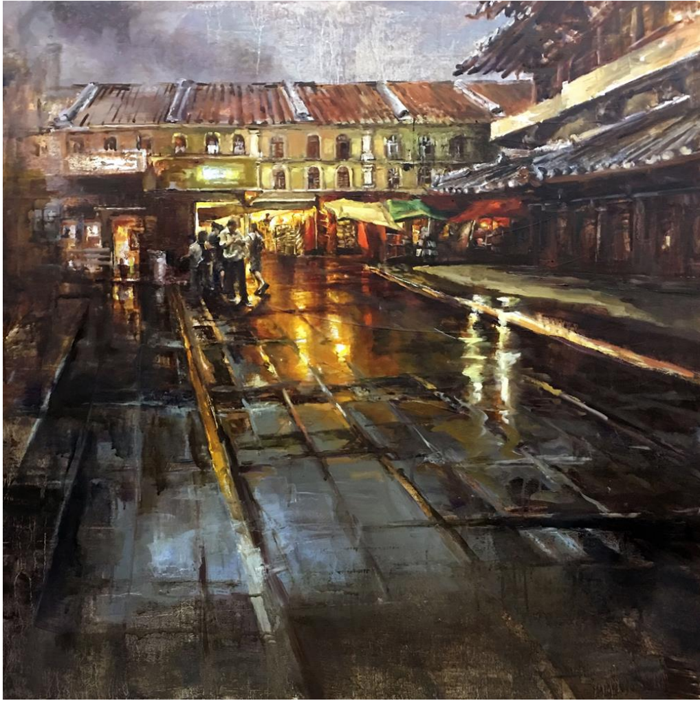
Encounter with Twilight #3, oil on canvas, 100x100cm, HK$17000